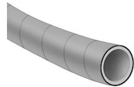
SS0201 – ½” ID BREWERY HOSE