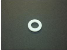
TEFLON SEAL, COUPLER NUT