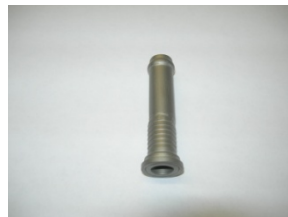
EXTENDED HOSE BARB