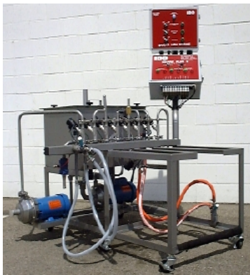
SQUIRE 'PLUS 2'

The Squire 'Plus 2', Mini King & Mini King 'Plus 2' machines, the standard within the worlds craft brewing industry. With more than 300 of these systems installed worldwide in Brewpubs, Micro-Breweries, Cideries and Wineries, they are the ideal system for 20 to 35 kegs per hour output.