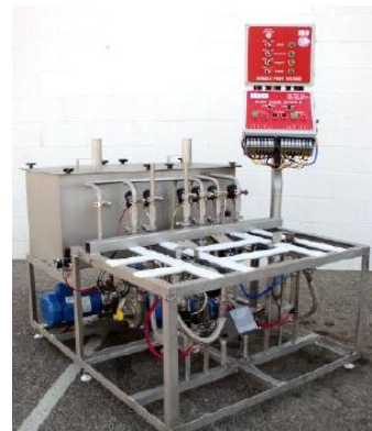
MINI KING 'PLUS 2'

5450 Tech Circle, Moorpark, CA 93021 Tel: 805-529-9890, Fax: 805-529-9282 Toll Free: 800-621-4144 Email: idd2jeff@aol.com , Web Site: www.iddeas.com