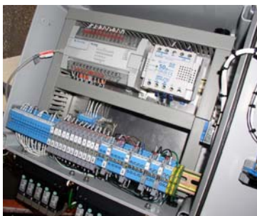
PROCESS LOGIC CONTROLLER